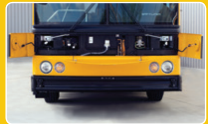
Full-width front access panel allows for easy access.