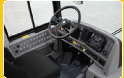
Easy-to-read gauges and an adjustable seat make driving easier.