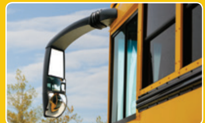
Flat and convex integrated mirrors improve rear-view visibility.