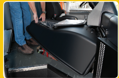
Easy engine access with no tools required.