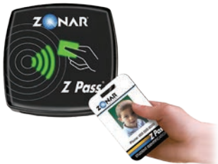
Riders scan RFID cards when they enter or exit the bus. This is an especially popular feature for field trips.

The ZPass+ feature allows parents to be notified instantly via email or phone, of the date, time and location their child has boarded and exited the bus. They can also keep track of bus locations on a map in real time, receiving estimates on arrival times. Schools can even send emails to parents about delays and schedule changes. Of course, all features are set and controlled by each school system to meet their specific needs. And the ultimate goal is to provide the highest level of child safety and security possible. To learn more, visit www.zpassplus.com , or talk to your Thomas Built dealer.