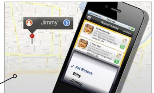
The ZPass+ mobile app allows parents to know instantly when and where their child entered or exited a school bus.